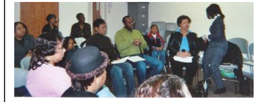
Above and Left: Parents engaged at the workshop sponsored by the PVS Education Committee & TPCBC Norwood Academy Saturday School on February 5, 2005