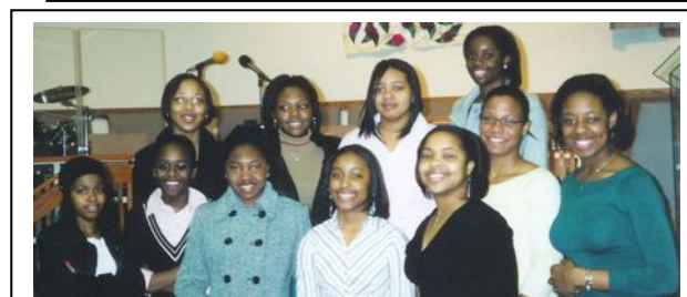
Right: ROP girls & graduates at the Black History Program in February 2005