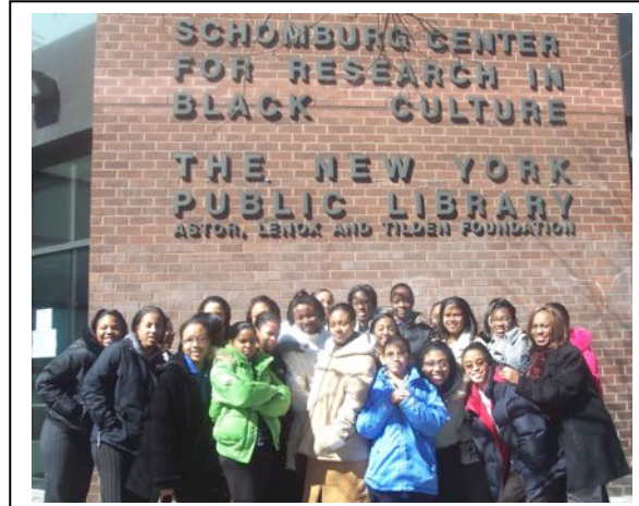
Below: ROP in New York City on March 5, 2005